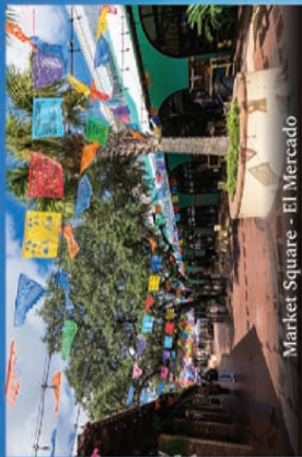
Market Square - El Mercado