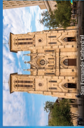
San Fernando Cathedral

Because we believe so strongly in the quality of our tours, we offer 100% satisfaction guarantee. We appreciate your business and strive to offer you the best vacation experience.