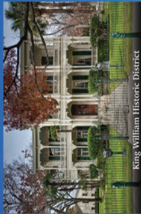
King William Historic District