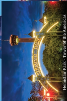
Hemisfair Park - Tower of the Americas